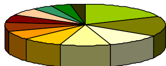
2006 Attendee Analysis