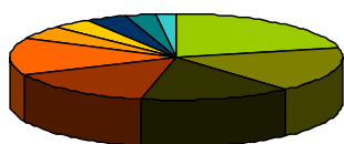
2006 Attendee Breakdown